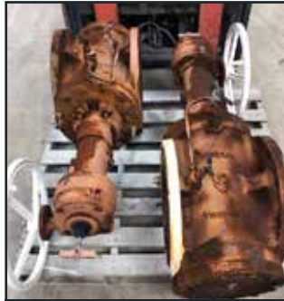
Before & After